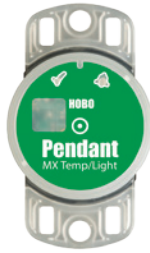
MX2202 Temperature / Light Depth rating 100 ft