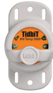
MX2204 Temperature Depth rating 5000 ft

► For complete information and accessories, please visit: www.hobodataloggers.com.au