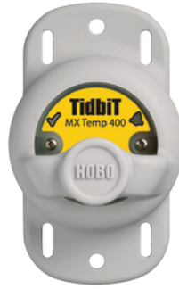
MX2203 Temperature Depth rating 400 ft