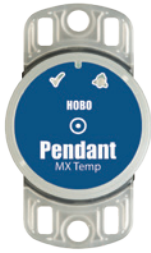
MX2201 Temperature Depth rating 100 ft